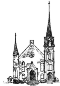
First Congregational Church Wallingford, Connecticut